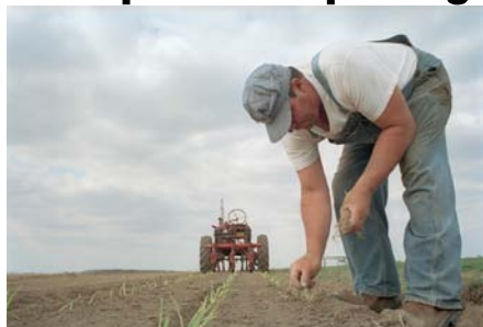
Example photo provided by ©David Riecks