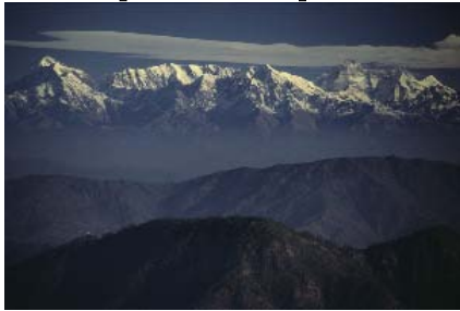
Example photo