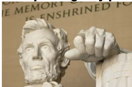
Example photo provided by ©David Riecks